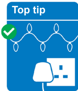
Unplug fairy lights